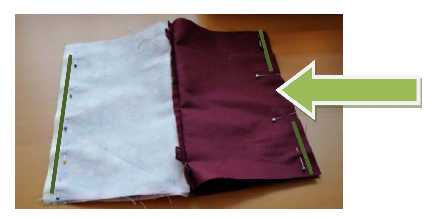
Result till now: