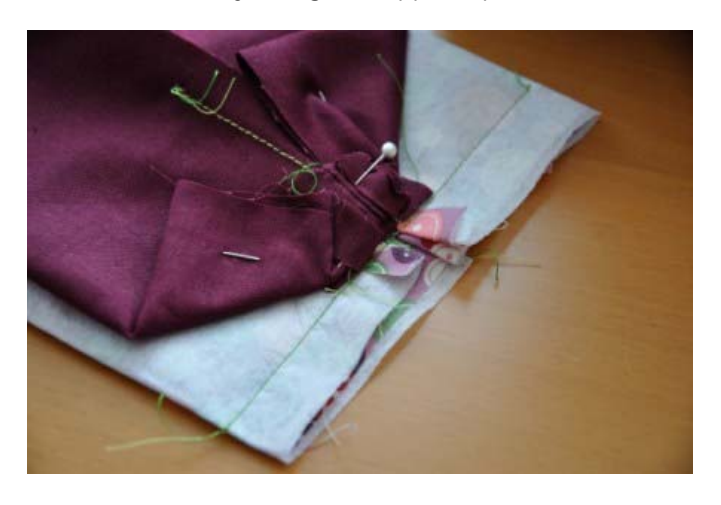
The same for the inside fabric: