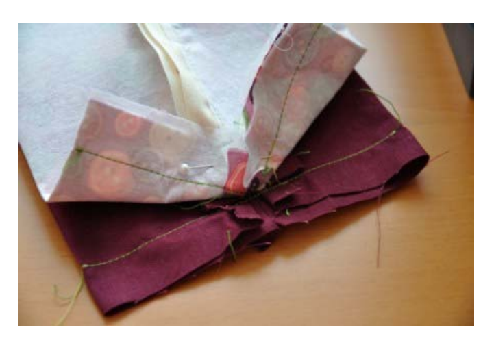
Do it in the same manner at the other side of the zipper.

N.B.: If you did not sew exactly along the zipper, just sew again, you will not see that at the end when turned.