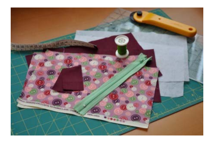
Stiffen the outside fabric with iron interfacing