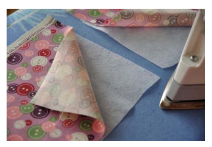
Fold and iron the rectangles for the zipper