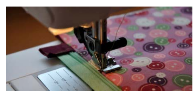
The other side of the zipper: