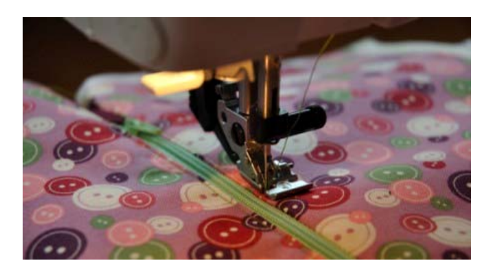
Result till now:

Fold again back and sew along the zipper: